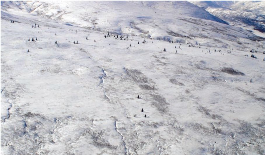
Fig. 2. Sparsely distributed spruce considered to be analogous to glacial-refuge populations. DNA and fossil pollen data suggest that such small populations survived the Last Glacial Maximum in Alaska and that they were important for boreal-forest development after the end of the last glaciation (7).

environments probably tens of kilometers from ice sheets (8, 9) and even in ice-free areas north of ice sheets (7). Thus, it appears that small populations of trees can endure extreme climatic conditions for tens of thousands of years (Fig. 2).