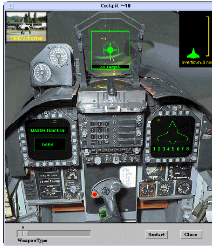
Figure 3: Customized simulator front-end for an avionics system.

language of Spin. The user can demonstrate and validate a property violation detected by Spin with the SCR simulator.