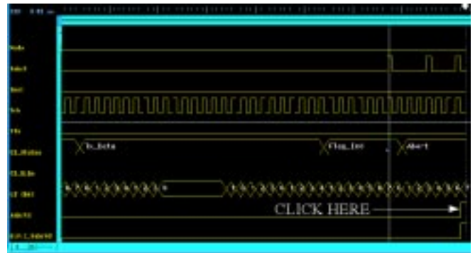
Figure 2: The FormalCheck error track waveform panel.

At the back end of a model-checker, where design bugs are demonstrated through error tracks, there was a spontaneous consensus to represent an error track through the classical simulation test representation of a waveform as shown in Fig. 2.