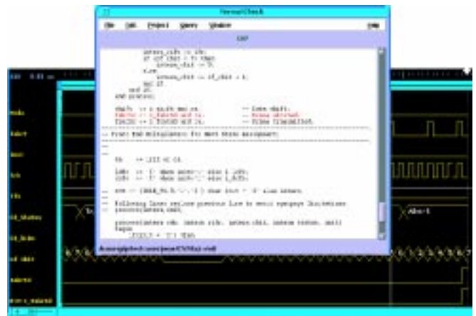
Figure 3: The FormalCheck Back-Reference utility through which a click on an error in the waveform pops up the source with the cursor on the line which caused the error.

In the FormalCheck tool, a back-referencing utility illustrated in Fig. 3 permits the user to click on an error in the error track waveform, and get a pop-up window of the VHDL or Verilog source, with the cursor on the assignment which gave the indicated variable the indicated value.