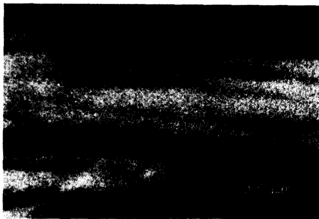
FIG. 1. Scanning electron micrograph of a cross section of a Ni-Zr composite foil as rolled.

where \lambda is the wavelength of the radiation, B is the linewidth, and 2\theta is the scattering angle. This microcrystal size is a lower bound on the lamella thickness since the thickness of the lamella must contain at least one microcrystal. The instrumental line broadening was measured with a single crystal and found to be 0.15^\circ . After appropriate account of the instrumental broadening was taken, t values of 500 and 600 Å were obtained for Zr and Ni, respectively. For the copper in Cu-Zr, t is equal to 250 Å. In both Ni-Zr and Cu-Zr composites, strong texture is observed. For Ni and Cu, the relative intensity of the (220) lines is higher than expected for the diffraction pattern of a randomly distributed powder. This is consistent with the description of the texture in cold-rolled face centered cubic metals given in the literature. 6 Among the Bragg peaks corresponding to zirconium, the (100) is barely present before the reaction while the (002) is relatively intense.