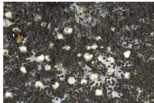
Figure 2. Approximately 41 white sclerotia can be observed on a close-up of Aspergillus niger IBT 29019 growing on Czapek yeast autolysate agar with raisins. Note the clear or brown exudate droplets associated with most sclerotia.