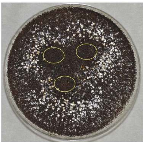
Figure 1. Numerous cream-coloured sclerotia produced on CYAR agar can be seen surrounding the raisins and the usual heavy sporulation caused by black Aspergillus niger IBT 29019 heads. The ellipses added show the position of the raisins, which are covered with black aspergilla.

No strains of Aspergillus niger sensu stricto , tested in this study or in our earlier studies, produced sclerotia on any of the conventional media tested. The closely related sibling phylospesies A. welwitschiae [54], formerly called A. awamori [54–55] also did not produce sclerotia on any medium. Initially A. niger IBT 29019 and IBT 24631 produced sclerotia on a medium made with dark Californian raisins added to the medium. Interestingly sclerotia were only formed on CYA medium with whole raisins, and not on the same medium with macerated raisins. It was decided to add