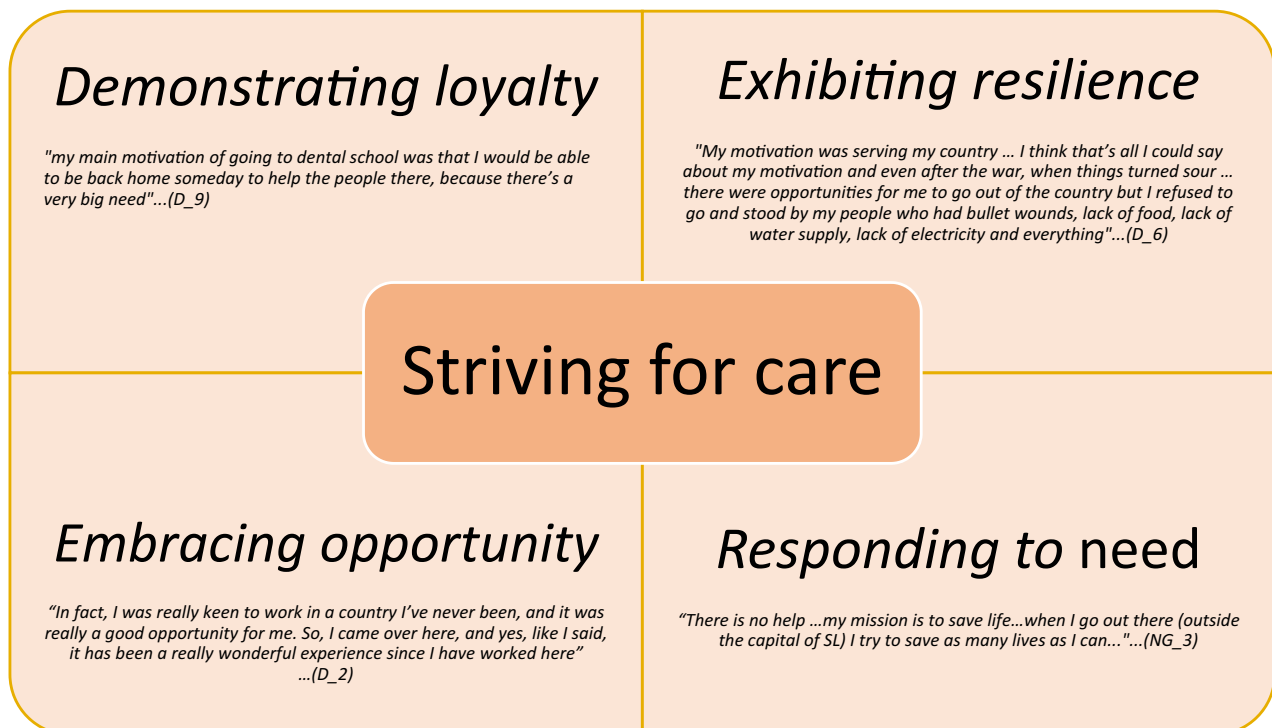
Fig. 3 Typology of dental professionals working in Sierra Leone

Emerging typology suggests four types of dental professionals which are not mutually exclusive: demonstrating loyalty; exhibiting resilience; embracing opportunity and responding to need (Fig. 3). A common theme evident through this study was that of an immense loyalty of Sierra Leoneans towards their family and friends in country. Whilst the participants outlined the challenges of oral health care delivery, Sierra Leoneans valued serving fellow citizens, together with being able to carry their family responsibilities even during adversity, reflecting