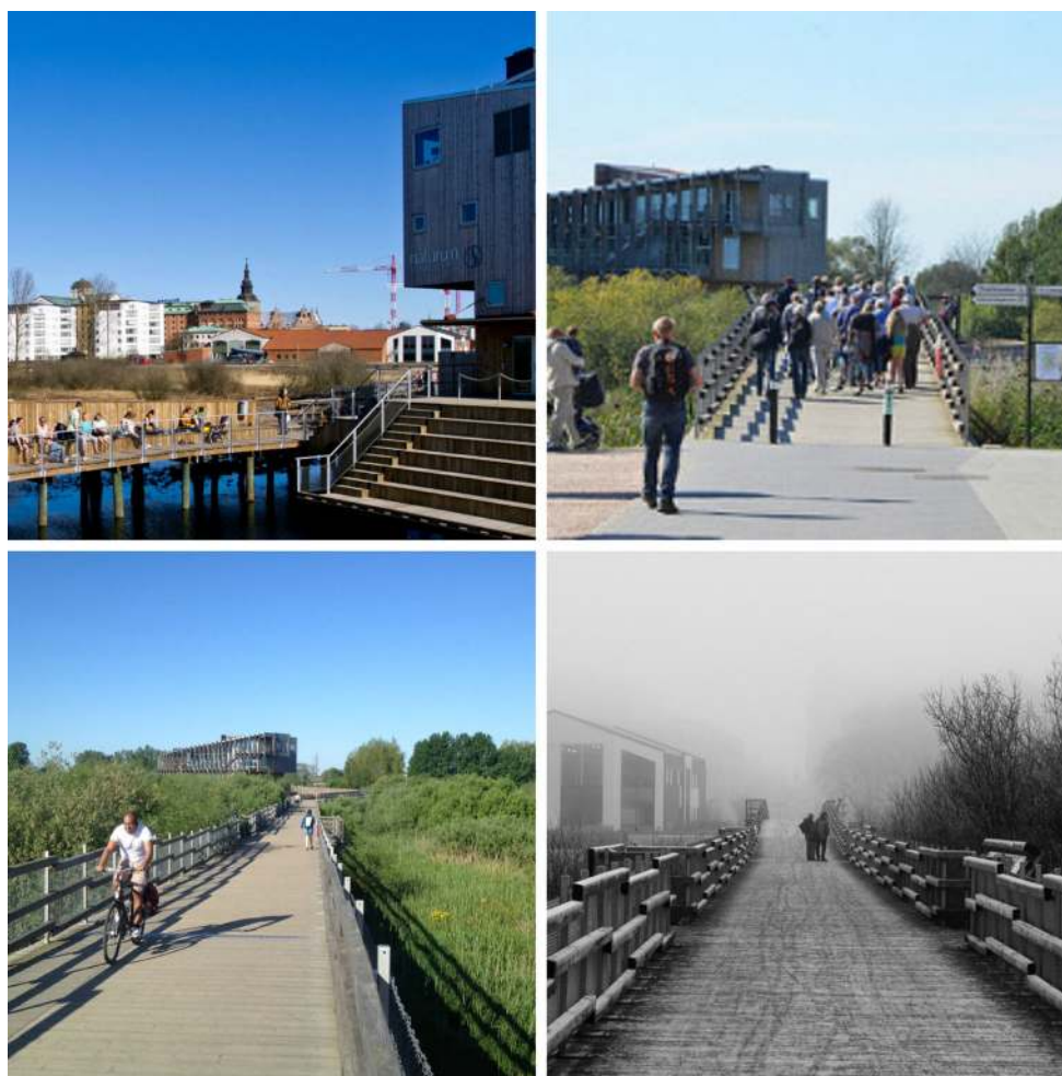
Fig. 3 Images of the walk/bike bridge in Kristianstad linking city sections, ecologically significant wetlands, etc.