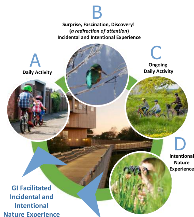
Fig. 1 Incidental nature experience cycle