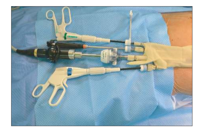
Fig. 1. The handmade port and instruments.

The patients were placed in reverse Trendelenburg position (15–30 degrees) with right side up. A 2.5-cm transumbilical incision was made and the handmade port was inserted. After making pneumoperitoneum, a flexible telescope was inserted through 3rd finger channel and then snake retractor was inserted through 2nd finger below the telescope. The snake retractor was angulated and retracted the liver. The GB was retracted laterally with a grasper which was inserted through 5th finger and the anterior peritoneum surrounding the cystic duct was dissected by left hand using a dissector through 1st finger channel (Fig. 2). After that, the left hand performed cephalic traction of the infundibulum and exposed the posterior peritoneum of the cystic duct, and then the grasper held in the