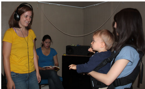
Figure 1. Experimental set-up for the interpersonal movement phase. The assistant holds the infant facing forwards towards the experimenter, while the neutral stranger sits within the line of the infant's sight, reading silently. (Online version in colour.)

that the movement of the experimenter did not influence her ability to bounce to the underlying beats in the song played over loudspeakers [45]. The interpersonal movement phase began when the song files started playing and ended when they stopped and was therefore 140 s in duration.