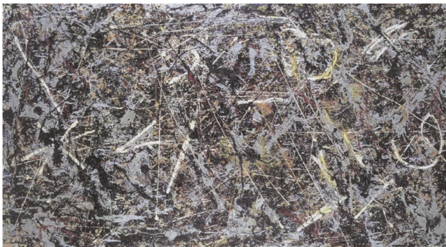
Figure 1 Alchemy , painted by Jackson Pollock in 1947. Drip paintings of this period are characterized by fractal dimensions close to 1.5.

With the subject fixating at the centre, a windmill pattern is presented that slowly rotates at 0.2 Hz in one direction for 5 s, and then in the other direction (Fig. 1a). If this is followed by a pattern orthogonal to the windmill, namely concentric rings, diverging and converging for 5 s each at 2 Hz, viewing a blank screen after the concentric rings causes a vivid after-effect of a stationary windmill for a few seconds. This after-effect is quite different from that seen after viewing the concentric rings alone at 2 Hz, if indeed any after-effect is visible. With a cyclical presentation of the sequence shown in Fig. 1a, a striking windmill-like after-effect is always seen after the concentric rings (bottom left blank in Fig. 1a), but no comparable after-effect is visible immediately after the windmill (top right blank in Fig. 1a). We found that the after-effect could be produced if the rings were delayed by up to 30 s, but not after 60 s.