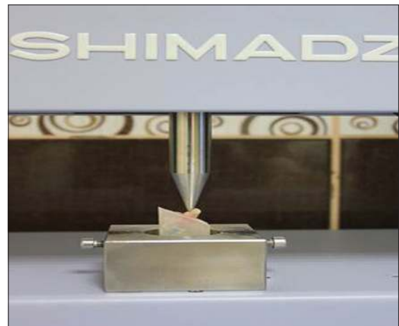
Figure 3: The universal testing machine

All the roots were fractured vertically that extended along the long axis of the root or fractures occurred