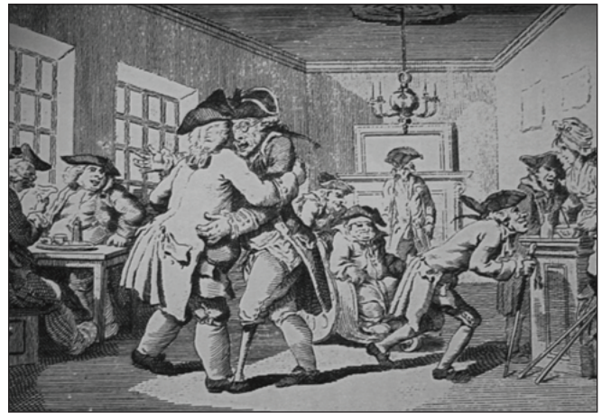
Figure 3. The Expedition of Humphry Clinker

One of the primary limitations in determining whether a work was an aggregate was the reliance on bibliographic records. The completeness of the records varied widely,