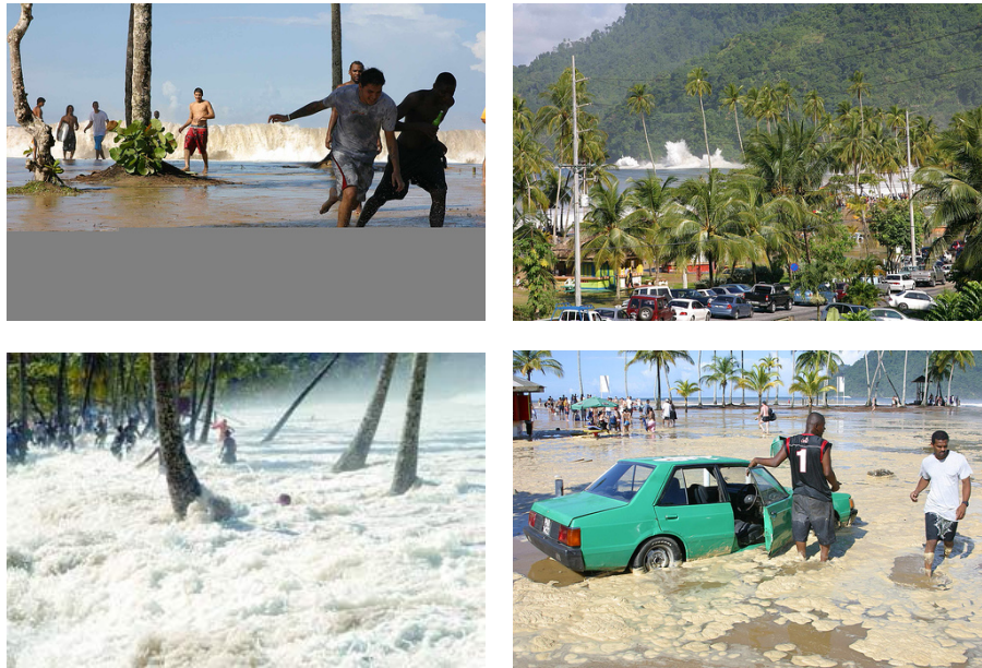
Fig. 4. The waves in Maracas Beach on 16 October (Stapleton, 2005).

waves about two times (1 m against 40–50 cm), passed the boat and broke at the coast (Ermakov and Vasilinenko, 2005).