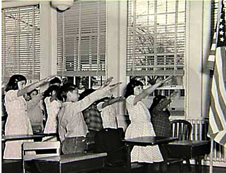
Figure 2 School children in Hawaii salute the flag, March 1941.

the hand remains over the heart. 155 The stage was thus set for the Supreme Court's six-to-three decision in West Virginia State Board of Education v. Barnette . 156