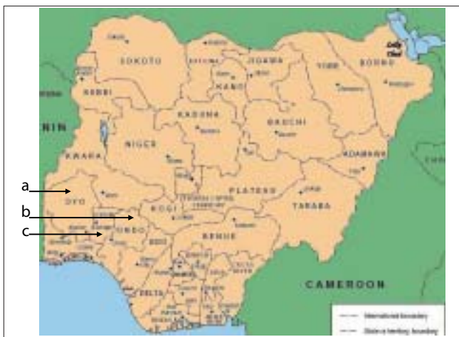
Figure 1: Map of Nigeria showing the states of the Federation. Data were collected from 3 states (arrowed) in Southwestern Nigeria, (a) Oyo state, (b) Ekiti state and (c) Osun state. Igbo-Ora in Oyo state (a), has the highest rate of twinning in the country and worldwide

Most reports on incidence of twinning in southwest Nigeria are from data obtained at Ibadan and Igbo-Ora in Oyo state and Lagos state. [9-11,16] These are just two out of the six states that constitute the southwestern part of Nigeria. In this study, we present information on the incidence of twinning in Ogbomoso, the second largest town after Ibadan in Oyo state [Figure 1]; Ile-Ife and Ilesa towns in Osun state [Figure 1]; and Ado-Ekiti, the capital of Ekiti state [Figure 1]. It is hoped that data obtained will extend current knowledge on the frequency of twinning in southwest Nigeria and contribute to the demographic studies in the country.