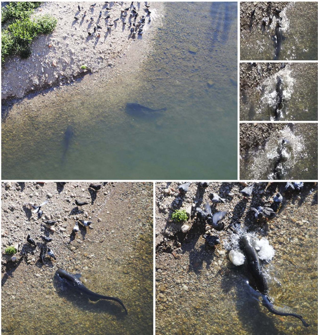
Figure 1. European catfish displaying beaching behavior to capture land birds. Several individuals were observed swimming nearby the gravel beach in shallow waters where pigeons regroup for drinking and cleaning (large picture). One individual is seen approaching land birds and beaching to successfully capture one (small pictures). doi:10.1371/journal.pone.0050840.g001

gravel island. Throughout the survey, river discharge was low and the water was clear, allowing full observation of all displayed behavior (Figure 1 and Movie S1).