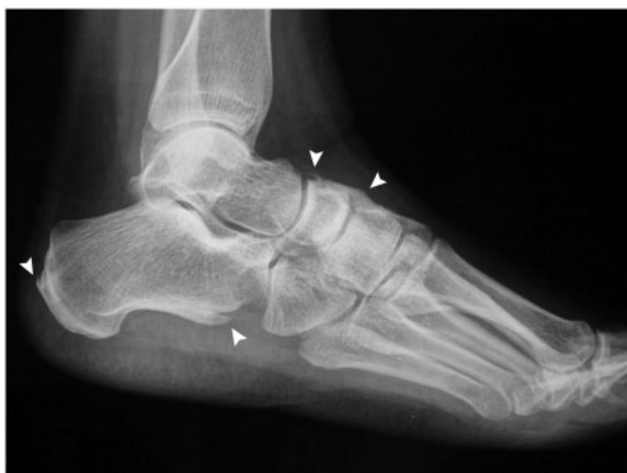
Fig. 1 Standard radiograph of the left foot.

New bone formation above the tarsum and at the capsular insertion of the calcaneocuboidal joint and bone spur at the calcaneal insertion of the Achilles tendon (arrowheads).