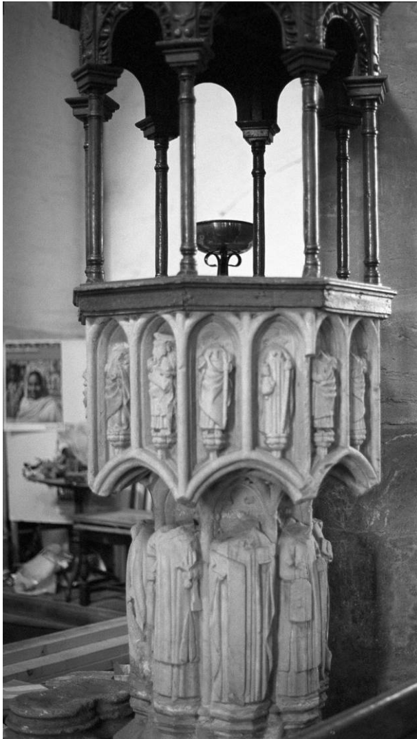
Figure 3. Iconoclasm to the heads of saints around the stem and bowl of the font at Watlington, Norfolk.

certain time can indicate aspects of how bodies were socially constructed at that time.