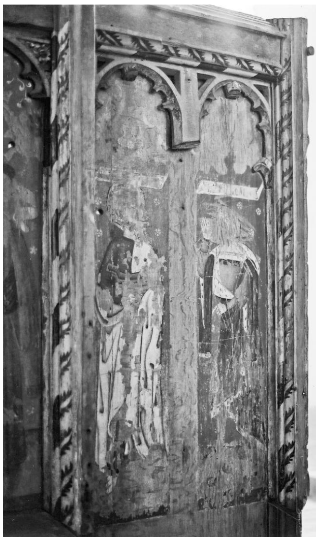
Figure 2. Iconoclasm to the heads and hands of saints on the rood screen of Salthouse parish church, Norfolk.

The ritual “killing of things” has been explored in archaeology by Hamilakis (1998), Chapman (2000), and others. It is the contention of this paper that the iconoclasm of the sixteenth and seventeenth centuries acted out ideas about the killing or mutilating of people. Miller (1985) has suggested that artefacts embody the fundamental elements of human categorization processes, and it is argued here that the treatment of artefacts which were themselves depicting human form tells us about contemporary categorization of parts of the body—that is, the way in which bodies were deconstructed at a