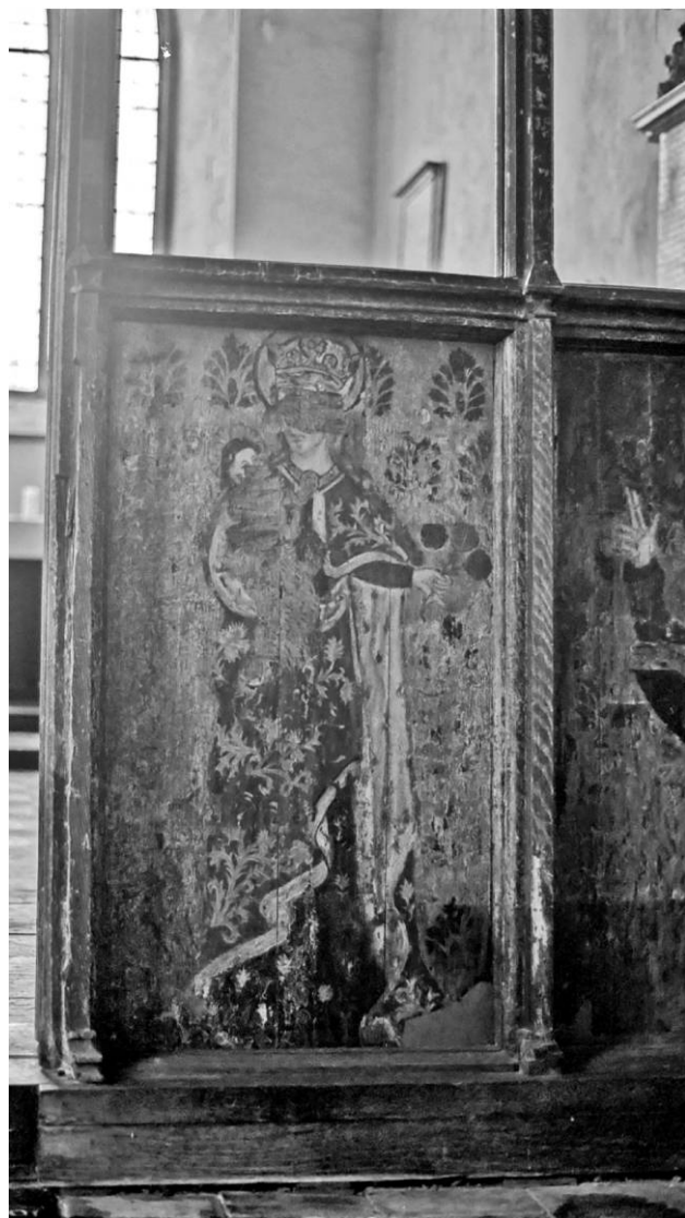
Figure 1. Iconoclasm to the faces and some of the hands of saints on the rood screen of Great Snoring parish church, Norfolk.

wood. On the font, the heads of all the sculptures have been knocked off.