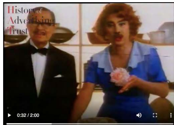
Fig. 21: Bamboo Steamer (1982-3)

For instance, an advert for an 'Oriental Bamboo Steamer' of 1982 contains a Burt Kwouk voiceover, in which virtually every phrase used is made to contain some kind of supposedly Chinese linguistic tick. For instance: 'herrow' for 'hello', 'terrovision' for 'television', 'please to get pen and paper leddy to lite our address' for 'please get [a] pen and paper ready to write our address', 'sirry irriot' for 'silly idiot', etc. ( Oriental Bamboo Steamer Commercial: Bamboo Steamer 1982).