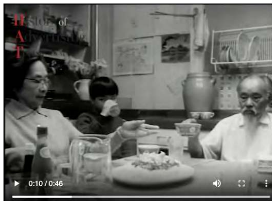
Fig. 5: 'Look in one night, while

This scenario will play itself out, and end in such a way as to recast the 'inscrutable Chinese' as eminently capable of laughter. The voiceover continues: 'Look in one night, when the family's eating Vesta chop suey'. The scene switches to a domestic kitchen, where three generations of an extended family are gathered round for a meal – of Vesta chop suey.