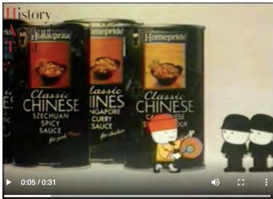
Fig. 28: Homepride Classic Chinese Sauces (1985)

another animated Chinese character facing a 'horde'. This time, the horde are a troupe of identical animated Homepride men. These characters were already very familiar to viewers, as they had for a long time featured in all Homepride commercials. However, this advert introduces a new 'Chinese' character, who announces his own arrival by sounding a gong (Fig. 28).