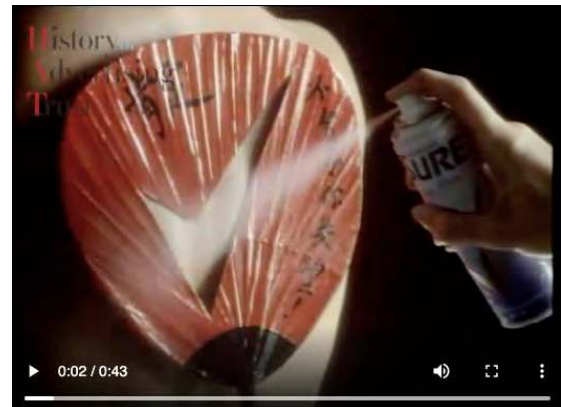
Fig. 23: Sure, ‘China Chase’, 1980s

The cool white individual versus multiple Chinese antagonists is a common trope, and it is not restricted to the male ‘white saviour’ genre, as exemplified by James Bond or Indiana Jones. White women can also be seen running rings around Chinese pursuers, as in an advert for ‘Sure’ deodorant, in which a young woman has the Sure logo (a tick, not unlike the more famous Nike swoosh) sprayed with deodorant onto her back. After a long chase through hot Hong Kong landscapes, she is shown to be sweating all over, apart from the area on her back that had been sprayed with deodorant ( Sure Commercial: China Chase 1980s ).