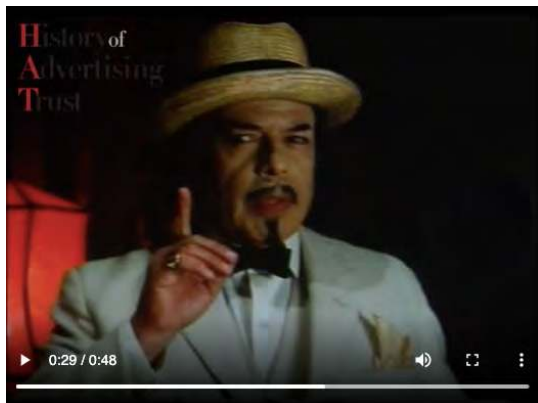
Fig. 14: Bird's Eye (1979)

misinformed stereotype about how the Chinese supposedly speak, including broken English, as she expresses hope that her husband will not be able to tell that she didn't actually cook the food herself. As she throws away the box that the food came in, her husband spies her doing so and hence deduces the truth. As he appears, he announces, in equally caricatural diction, that he knows what she has done. June confirms that she knew she'd never get away with it, because he is none other than famous detective, Charlie Chan ( China Dragon Range Commercial: Charlie Chan 1979).