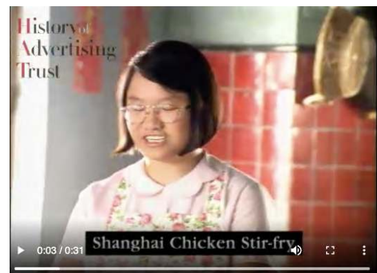
Fig. 41: Lea & Perrin's 'Woo-ster Sauce' (1996)

Domesticity is also played – albeit differently – in a British Lee and Perrin's Worcestershire sauce commercial from 1996. This advert places us as guests in a domestic Chinese kitchen, in the company of a housewife who is talking us through how to make a stir fry, incorporating what she pronounces as 'Woo-ister Sauce'. Most of the time is taken up by her instructional monologue, but the entire premise of the advert seems to have been how funny it will be when the hyperbolically English-sounding narrator pseudo-sinicizes his own pronunciation of 'Worcestershire Sauce' as 'Wooooo-ister sauce' at the end ( Lea & Perrin's Worcestershire Sauce Commercial: Shanghai 1996).