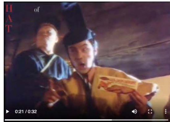
Fig. 12: 'An English-u biscuit-a-maker?' Golden Orient (1978)

The confusion of Chinese and Japanese imagery is nowhere more apparent than in the combination of ethnically Chinese Kwouk mouthing stereotypes associated with Japanese speech, such as adding an 'u' sound to the end of words and placing an 'a' in between certain words ( Golden Orient Commercial: Emperor 1978).