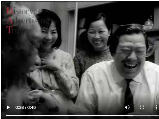
Fig. 7: Vesta Chop Suey (1967)