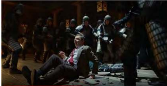
Fig. 46: Snickers Advert (2014)

what remains presented as a simultaneously familiar-yet-foreign activity – cinematically spectacular Chinese martial arts.