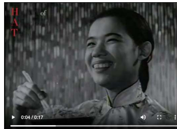
Fig. 2: Kellogg's Cornflakes (1956)

close up, holding a bowl in front of her chest and eating the contents with chopsticks. From the first moment, the visual image is accompanied by the strumming of oriental-sounding instruments, such as the yangqin and pipa. As will become the case across many subsequent adverts, it is the sound of the music that effectively announces the presence of Chineseness. Then a voiceover says, 'Like Yum-Yum, enjoy the taste of Kellogg's Cornflakes'. The girl then begins to laugh (Fig. 2) – perhaps to register how funny it is to eat cornflakes (which are conventionally served in milk) with chopsticks, or perhaps just to signal the sense of enjoyment ( Kellogg's Corn Flakes Commercial: Chinese Girl 1956).