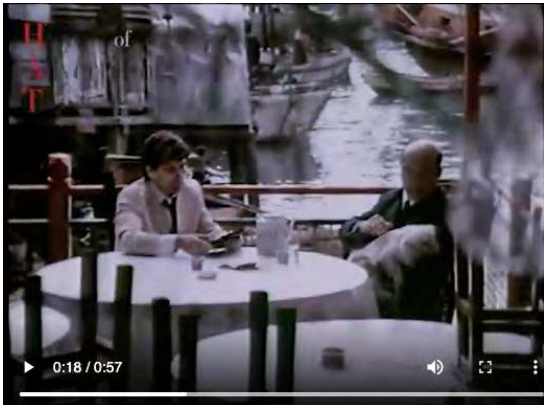
Fig. 10: Benson and Hedges (1975)

Although Hong Kong here represents 'China', Hong Kong itself features in numerous different kinds of adverts through the 1970s and 1980s. It often features in adverts for British Airways, in whose adverts the British Crown Colony is presented as an interesting and exotic stop-over on long-haul flights. This attribution of a 'stop-over status' adds weight to the arguments of certain cultural critics in the 1990s about Hong Kong's longstanding status of being 'neither here nor there', but constantly in between (Chow 1992; Abbas 1997; Chow 1998b; Morris, Li, and Chan 2005).