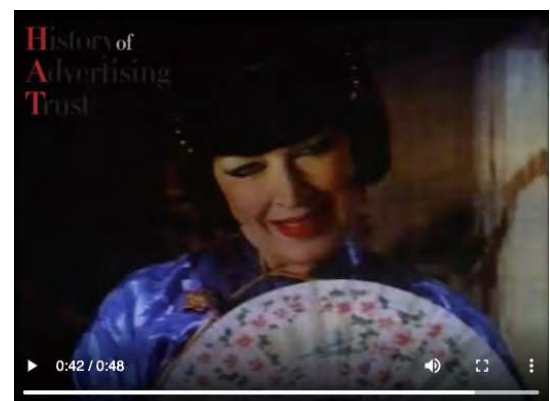
Fig. 13: Bird's Eye (1979)

This advert is only the tip of an iceberg in this respect. British TV advertisers have long been fixated not only on Chinese accents in general but also on certain perceived pronunciation problems in particular – specifically, as we have already seen, in the misplacing of the letters L and R, wherein 'very' is believed to be pronounced 'vely' (or 'vewy') and 'lock' is believed to be pronounced either 'rock' or 'wock'. In British contexts, these mispronunciations are frequently, yet incorrectly, associated with Chinese people. Perhaps the most exemplary case appears in 1979, when the otherwise entirely reputable white British actors, June Whitfield and David Suchet, indulged in an embarrassing case of 'yellow-face' – or, as they might say in this advert, 'yarrow-face' or even 'lerrow-face'.