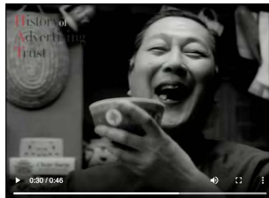
Fig. 6: inexplicable laughter

It takes an effort of interpretation to work out the intention animating this advert. Clearly, the 'Chinaman' needs to laugh by the end of the advert in order to resolve the opening question. And perhaps the group laughter is intended to suggest a shared joke – perhaps that white Westerners think chop suey, as an 'authentic Chinese meal', is hard to make, but really it is easy because Chinese families just use Vesta?