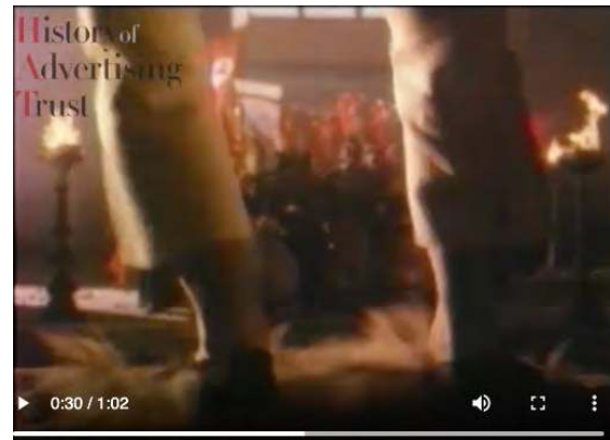
Fig. 26: White g -wearing 'monk' prepares to defend a Shaolin-esque Temple 'Chinese Warrior', BT (1985)