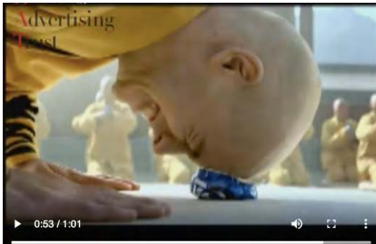
Fig. 45: Pepsi (2002)

pilgrimages and residencies in institutions such as the Shaolin Temple are increasingly popular with Westerners (Polly 2007; Frank 2006; Griffith, Marion, and Wulff 2018). Similarly, other related forms of the domestication of ‘essentially Chinese’ practices is increasingly common (Frank 2006; Ryan 2008).