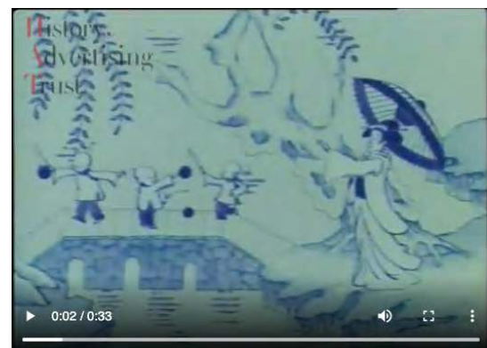
Fig. 16: Knorr (1979)

Interestingly, both of these Knorr adverts also play on the theme of speech and accent. However, they approach the theme of Chinese dialogue from the opposite direction, by giving the 'Chinese' characters broad cockney (working class London) accents. In one of these two adverts, we see a female character trying to get home and complaining bitterly about the day she has had and her journey home, in a broad cockney accent (Fig. 16). By the end, we see her standing on a jetty as three boats appear. In response – echoing a very familiar British complaint about buses – she says, 'typical, you wait for ages and then three turn up at once!' ( Knorr Knoodles Commercial: Bus Queue 1979).