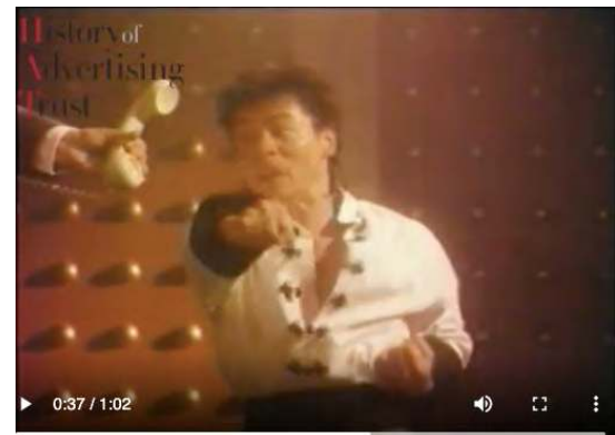
Fig. 27: 'It's for you-hoo!', BT (1985)

This advert explicitly acknowledges its televisual antecedents when the white-clad warrior carries out his (L/R-conflating) telephone conversation with his father ('Father say, it is better to be friend than enemy', etc.). He concludes it with the instantly recognisable question, 'How is Grasshopper?' Grasshopper was, of course, the affectionate nickname given to the young character, Caine, in the classic 1970s TV series, Kung Fu . This illustrates the extent to which orientalist martial arts cinema and TV of the 1970s was still playing itself out intertextually in media culture of the 1980s.