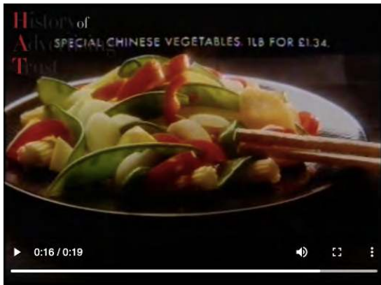
Fig. 30: Bejam Chinese Vegetables (and hilarious chopsticks) (1987)

Chopsticks still remain a source of comedy in 1992. We see this in an advert for 'Chinese Oxo'. This product was a variant of standard Oxo cubes, long used for making gravy in the UK. The advert for Chinese Oxo plays out a scene in which the parents of an adult son go to his and his partner's new house for dinner. They enter the domestic kitchen and dining room where the son's partner is preparing dinner with 'Chinese Oxo'. The Chinese meal that is eventually served up is presented as something quite curious and unusual in and of itself – an exotic and interesting 'event' meal. The novel status of all of this is foregrounded in the conversation, which centres on the topic of the (white English) diners never normally eating Chinese food and being unable to use chopsticks ( Oxo Commercial: Chinese Oxo 1992).