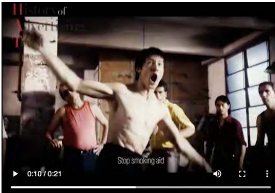
Fig. 44: Nicorette 'the closest thing to...' (2010)

advert in 2010 for Nicorette Inhalers that directly references the idea that its Bruce Lee lookalike star is not the real thing, with its strapline of 'the closest thing to...' (Fig. 44) ( Nicorette Inhalator Commercial: Kung Fu 2010). Clearly, it can be seen that TV adverts often follow and riff on themes first produced and popularised in film. However, it deserves noting that – sometimes, at least – despite the proliferation of adverts that construct Chineseness via stereotypes, clichés and out-and-out racist material, some adverts can arguably be said to construct Chineseness in ways that have to be evaluated as 'positive' (at least according to the yardsticks of certain anti-orientalist approaches to film, TV, media and cultural studies).