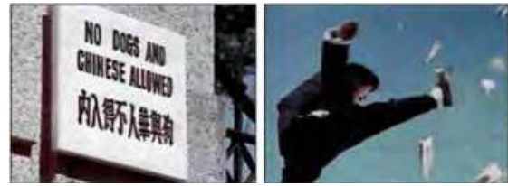
Fig. 20: Bruce Lee's Chen Zhen destroys the 'No Dogs and Chinese Allowed' sign in Fist of Fury (1972)

Moreover, when viewed from the position of a broader survey of the construction of Chineseness in British adverts, it seems ironic that this advert was banned. For, multiple adverts, before and since, have committed far worse representational crimes.