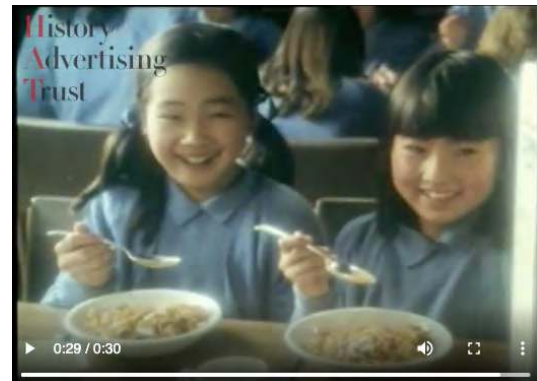
Fig. 11: Kellogg's Cornflakes (1976)

racism is the formulation, 'they all look the same'.