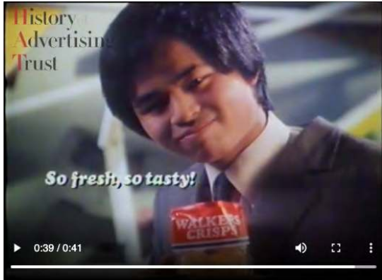
Fig. 19: Walker's (1983)

point the customer explodes with rage and begins smashing the wooden kiosk to pieces with chops, strikes and jumping kicks (Fig. 18).