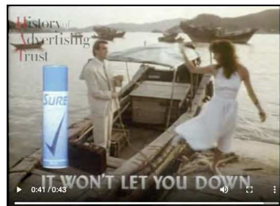
Fig. 24: Sure, ‘China Chase’, 1980s

Interestingly, this advert effectively repeats the structure of the previous Benson and Hedges advert, except this time it is a woman who is being chased by Chinese police, who have witnessed her escaping from a hotel window. We have already seen her pick up a man’s wallet and begin her escape. So, we assume she is a criminal. The police chase her through city streets and the confusion of a lion dance, but she makes it down to the docks, where she meets a man and delivers his wallet – he has evidently forgotten it. The locations used in this advert are so similar that they are likely to be the very same locations used in the earlier cigarette advert.