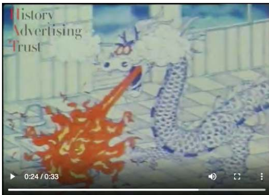
Fig. 17: Knorr (1979)

a male cockney voice. In this advert, the working-class man expresses relief at not having to see his mother-in-law. This is because, we are told, she is a 'dragon'. This conventional sexist cliché of the 1970s about mothers-in-law being 'dragons' serves as a bridge to return us to a stereotypically Chinese theme: upon the man making this statement, we are shown a literal animated Chinese dragon (Fig. 17) ( Knorr Knoodles Commercial: Mother In Law 1979).