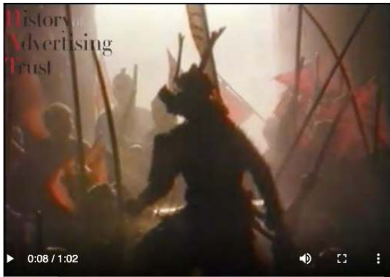
Fig. 25: Warriors arriving, 'Chinese Warrior', BT (1985)

scenario. 6 It is only bigger budget advertisers that can easily simulate an expansive Chinese landscape or cityscape. But even when advertisers are able to afford to simulate a lavish Chinese scene, they still use many of the other stereotypical elements too, such as accents, mispronunciations and – more recently – martial arts.