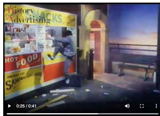
Fig. 18: Walker's (1983)

Both speakers communicate stereotypically. The vendor has a strong cockney accent. This will turn out to be vital for the 'success' of the advert, because its conclusion relies on a joke based in 'cockney rhyming slang'. Meanwhile, the Chinese man speaks in the stereotypical way Chinese people are often depicted as speaking English, involving such features as dropping pronouns, speaking in the singular and tending to stay in the present tense.