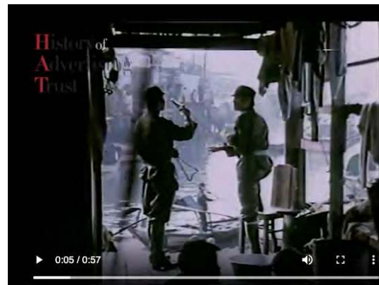
Fig. 9: Benson and Hedges (1975)

Similarly, the cigarette brand, Benson and Hedges, takes another line on the James Bond theme with its 'Escape' advert, shown during the early 1970s, in which a white Western man attempts to escape from a Chinese-esque location.