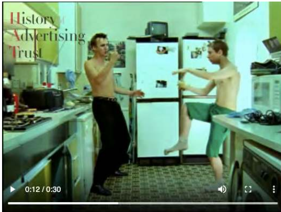
Fig. 42: Super Noodles 'Shaolin' (1998)

This is just one variant of an ever-growing catalogue of adverts that register these recurring sets of stereotypical connotations and associations. As we have seen, martial arts themes enter into the assemblage of stereotypes signifying Chineseness during the 1980s and 1990s. This arguably becomes the dominant trope, albeit rising to the ascendant, without fully displacing or replacing earlier clichés, images and tropes.