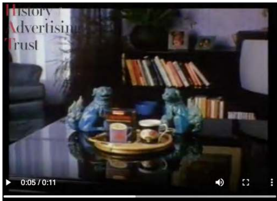
Fig. 22: Batchelors (1987)

and enjoy this 'vely tasty' product ( Batchelors Cup-A-Soup Commercial: China 1987 ).