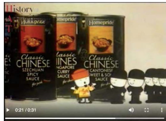
Fig. 29: 'So sorry: All Homepride look same to me' (1985)

All of these examples provide ample evidence that the basic stereotypical structures of the visual and aural signifiers of Chineseness changed very little between the mid-1950s and mid-1980s.