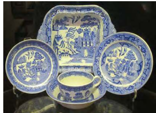
Fig. 15: 'Different Shapes in a Willow Pattern, 19 th Century', Wmpearl 4

However, in the same year (1979), Knorr released two adverts for 'Knoodles' (pronounced 'canoodles'). Both used animation, in which Chinese-looking characters move about against a backdrop clearly intended to be interpreted as Willow Pattern (a 'Chinese' style design used on all manner of crockery, which was very popular in the UK in the 1970s). However, the visual semiotics slip and slide between Chinese (Willow Pattern) and Japanese (Samurai) imagery.