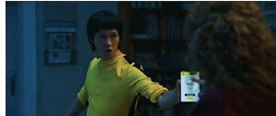
Fig. 43: OVO 'Boost Lee' (2017-19)

modulation of this imagery relates to the hit millennial film, Crouching Tiger, Hidden Dragon – a film credited with installing wuxia aesthetics and 'wire fu' firmly within the lexicon and aesthetic universe of Western visual culture (Hunt 2003; Park 2010).