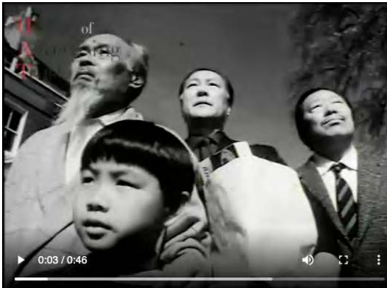
Fig. 3: 'Did you ever see a Chinaman smile?'

In the Vesta Chop Suey advert, a group of Chinese men and a boy wearing Western clothes walk along a presumably British street. A voiceover asks us: 'Did you ever see a Chinaman smile?' What is today a self-evidently alarming and unavoidably racist formulation is uttered easily in 1967, as the establishment of a conceit, like the opening line of a joke.