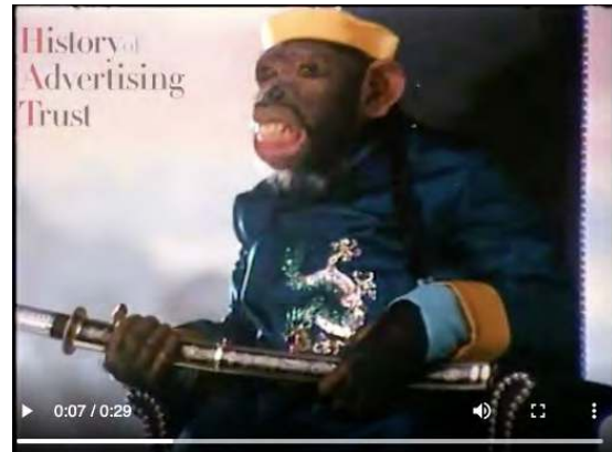
Fig. 8: PG Tips (1974)