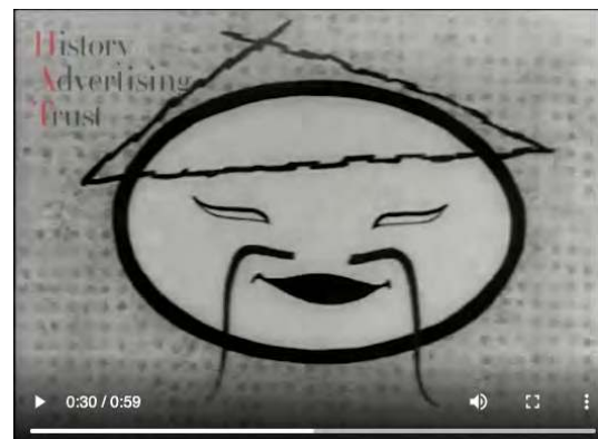
Fig. 1: Esso Extra (1956)

Within the first year of ITV broadcasting, some of the adverts shown were already trading on ideas of racial and ethnic difference.