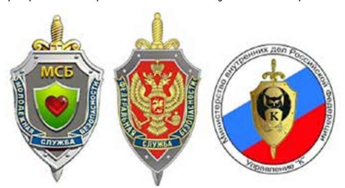
Figure 1. From left to right: emblems of the MSB, FSB, and the MVD's "K" Department<sup>14</sup>

Just as MSB displays on the walls of its office and on its VK page<sup>12</sup> the decorations and acknowledgments it has received from the various local police authorities,<sup>13</sup> it has adopted a logo containing a sword and shield that is reminiscent of various law enforcement bodies, particularly the FSB and the Cybercrime department ("K" Department) of the Ministry of Internal Affairs. A red heart in the middle of the shield instead of the two-headed eagle symbolizes the MSB's role as a human intermediary between the people and the police, added to its loyal service to preserve the law.