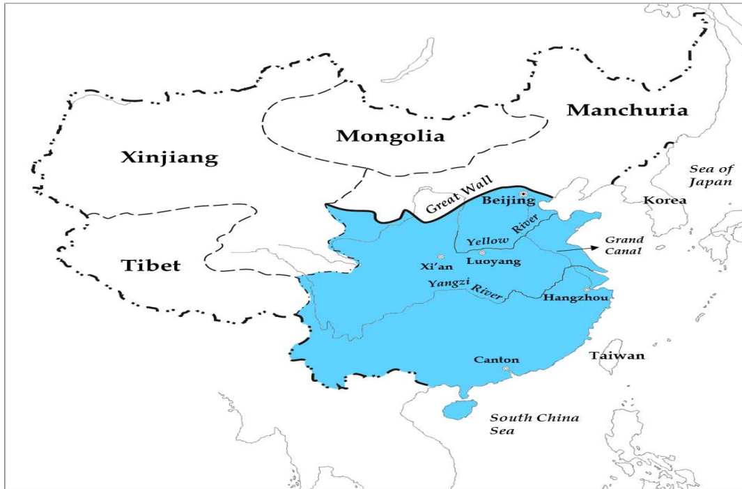
Map 1. Chinese Territory under Ming (shaded) and Qing