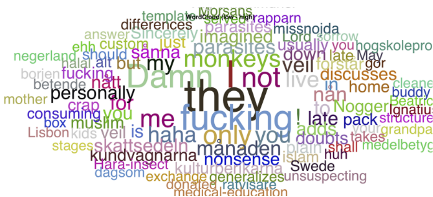
Figure 1b. Word cloud showing words with significant negative (indicative of early usage of the words) correlations between word frequency and time of writing on the forum for individual users (i.e., the logarithm of the number of days plus one since an individual user makes the first post on the forum). Colored words are significant following Bonferroni correction for multiple comparisons, and grey words are significant at p < .05 . Font size is proportional to the relative correlation.