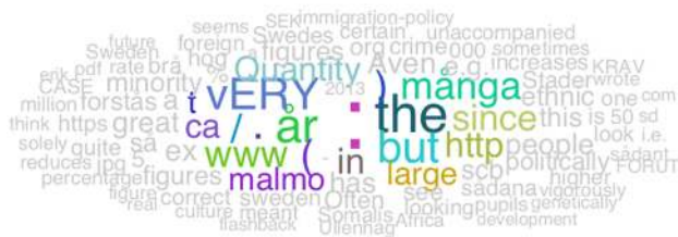
Figure 1c. Word cloud showing significant positive (indicative of late usage of the words) correlations respectively, between word frequency and time of writing on the forum for individual users (i.e., the logarithm of the number of days plus one since an individual user makes the first post on the forum). Colored words are significant following Bonferroni correction for multiple comparisons, and grey words are significant at p < .05 . Font size is proportional to the relative correlation.

Correlation between LIWC dictionaries. Table 1 shows how the LIWC scores from different LIWC dictionaries correlate with each other. First, the pairwise correlation between all LIWC scores for each participant was calcu-