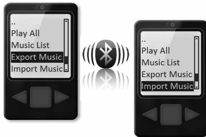
Figure 4. Extension of the MP3 Player example to a collaborative item, which has to be solved in a joint effort.

A group of experts from different fields busily works on solving these issues juggling with practical, political, and scientific desiderata. Arguably, the PISA 2012 problem solving processes will be maintained but additional collaboration processes will be included, where substantially altered or even completely new items will be employed. Whether this yields in valid results representing important real world challenges remains to be seen. Towards the end