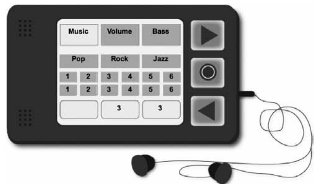
Figure 1. MP3 Player as an item example for interactive problem solving. This item was published by the OECD (2011) as an example of the PISA 2012 interactive problem solving assessment.

hand, people born a few generations ago would have been utterly lost confronted with a device which was supposed to digitally play music. Imagine you came across an MP3 Player for the first time having only a slight idea what it might be used for (Figure 1; Funke, 2001; Greiff, 2012). What would be your natural approach to master this device?