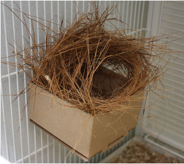
Fig. 1 Photograph of a nest constructed by a pair of zebra finches in our laboratory.