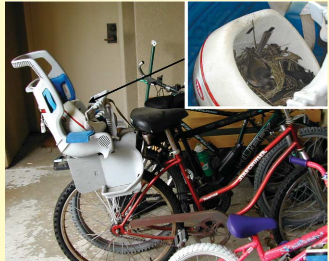
Figure 1. Nest of a dark-eyed junco Junco hyemalis in a styrofoam bike helmet at San Diego, California.

During the two decades since establishment, the urban population has evolved rapidly, losing 22% of the white in their tails [11]. The change in this socially selected signaling trait was the result of selection rather than of either plasticity or genetic drift. Selection on this trait reveals the differences between the wildlands, where there is strong competition for mates (and, hence, socially selected signals are important), and cities, where increased parental care and strong competition for food prevail and so there is less need for such signals [49].