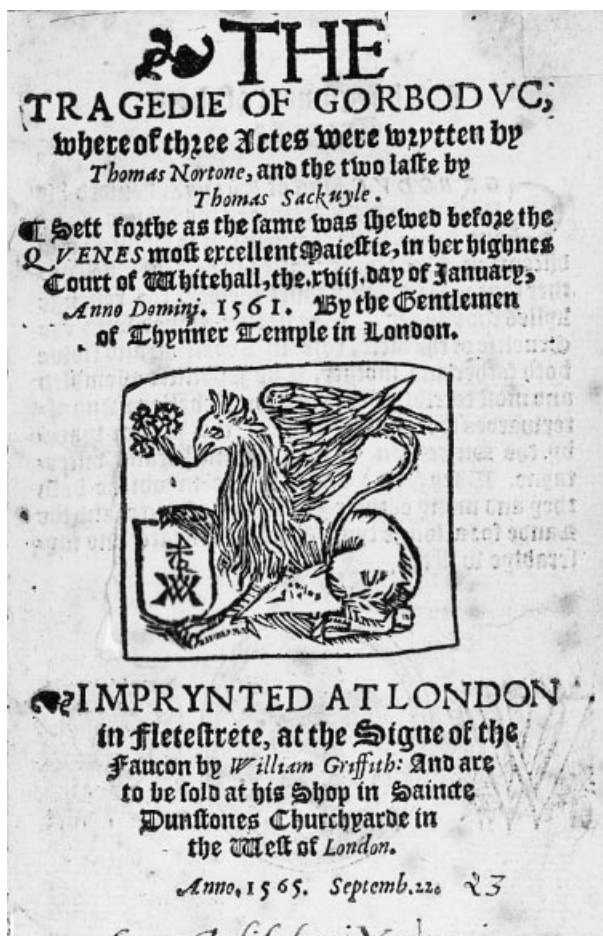
Figure 1 Title page: The Tragedie of Gorboduc , 1565

hundreds of extant title pages of early modern dramatic texts that would be printed over the next seventy-five years. All the information that would become standard for title pages of printed plays can be found in the proper place. The title, “THE / TRAGEDIE OF GORBODVC,” appears at the top of the page, facts of publication and sale appear at the bottom: