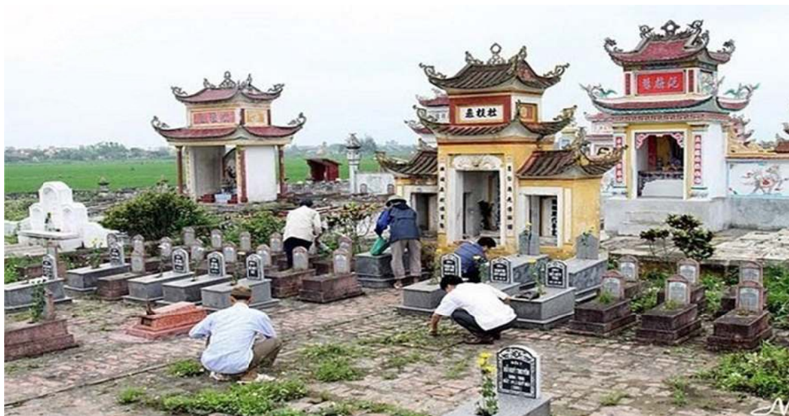
Figure 2. The custom of visiting ancestral graves on the occasion of Lunar New Year