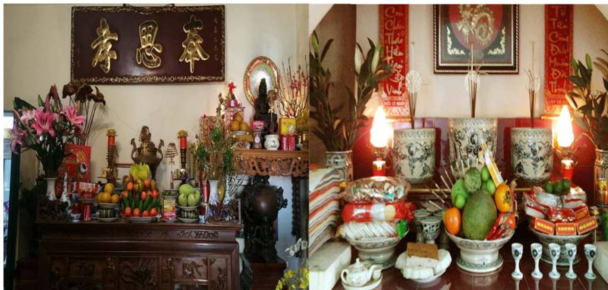
Figure 3. Altar where the ancestor worship in the family

Vietnamese people make offerings to their ancestors' souls on their date of death (death anniversary), which is usually calculated according to the lunar calendar. Descendants believe that it was the date when their ancestors' souls went to the afterworld. Not only on death anniversary, but the worship of ancestors is also carried out regularly on the first and the fifteenth of lunar months, and holidays. When there are important events in the house such as getting married, giving birth, building new houses, going away for work, taking examinations, etc., Vietnamese people also make offerings to their ancestor souls to report and pray for good luck or to show gratitude when their work is successful.