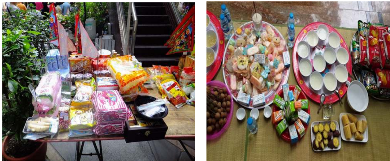
Figure 4. Items to worship souls outside community

children are often insulted by enemies to be robbers of porridge in banyan leaves” (Anh, 2005, p. 51). “In three summer months, on the first and the full moon of each lunar month, people cook porridge, wrap it into banyan leaves and leave these leaves with porridge inside along the roads, which is called worshipping all souls. So the customs of the Vietnamese people said that robbing porridge of Da leaves is saying people without children (Binh, 2005, p. 149).