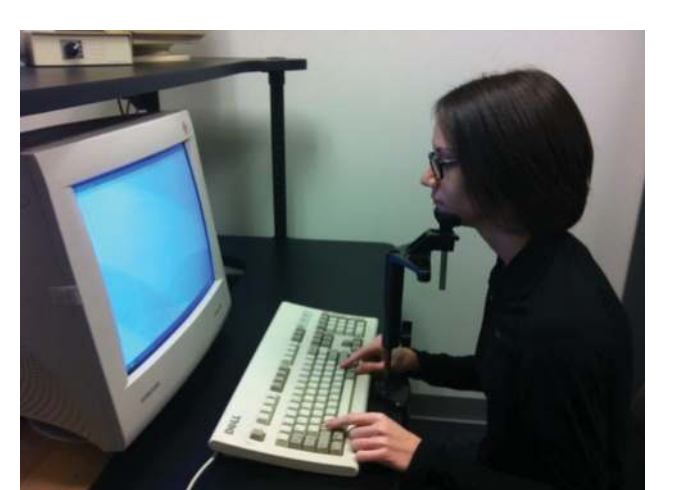
Fig. 1. A typical setup for studying perception. Chin rests are used to minimize head movements.

representation of shape (Marr, 1982), object identification (Yantis, 2000), or spatial layout (Palmer, 1999), based on the impoverished information given in the display uninformed by human action and its consequents.