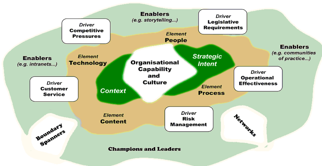
Figure 2 A visualisation of the Knowledge Eco-System from the Australian KM Standard (AS 5037—2005)