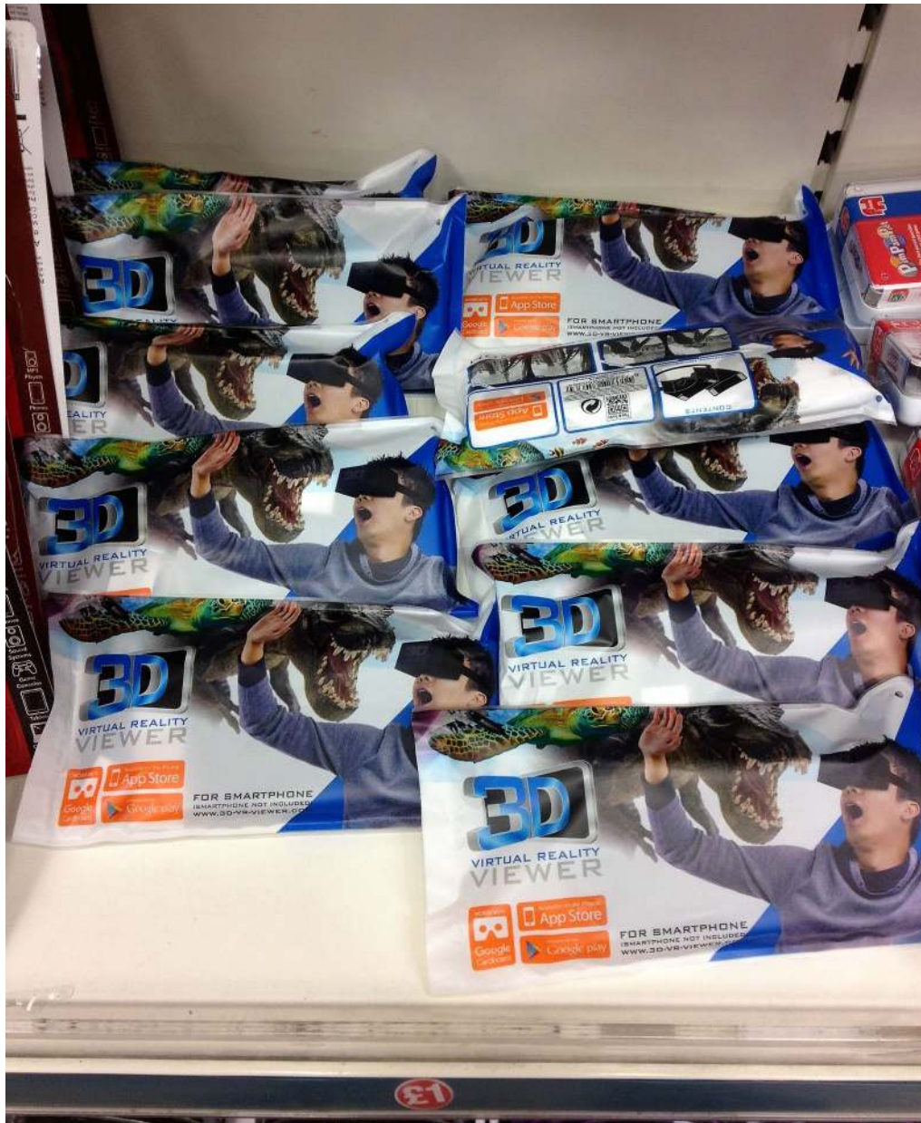
Fig. 1 Due to their very low manufacturing costs, it is not uncommon these days to find Google Cardboard-based VR sets, such as the ones shown in this photo, offered for prices as low as GBP £1 or EUR €1.5 in variety stores across the UK and Europe, or even free of charge from many sources as promotional gift items