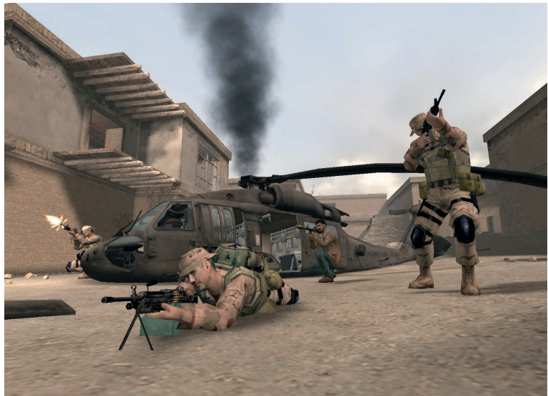
Figure 2. America’s Army. The most widely used and successful serious game to date, this title initially served as a recruiting tool.

These comments led us to wonder how much of K-12 science and math education could be taught via games and how we might exploit students’ capability for collateral learning —the learning that happens by some mechanism other than formal teaching. Ultimately, we wondered if we could incorporate all K-12 science and math education