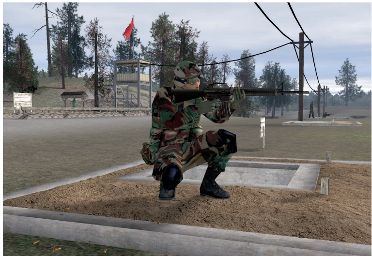
Figure 3. Training simulator. Despite the initial evaluator’s skepticism, America’s Army proved to be an effective military training simulator. Soldiers who played the rifle range segment of the game, for example, earned improved scores on the real-life rifle range.

in a highly immersive, highly addictive game—we called this our “first-person education” grand challenge, a play on the phrase “first-person shooter.” 6