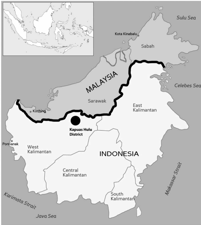
Figure 1. Map of Borneo.

Indonesian journalists who visited the remote West Kalimantan borderland in the heyday of illegal logging in 2004 wrote: