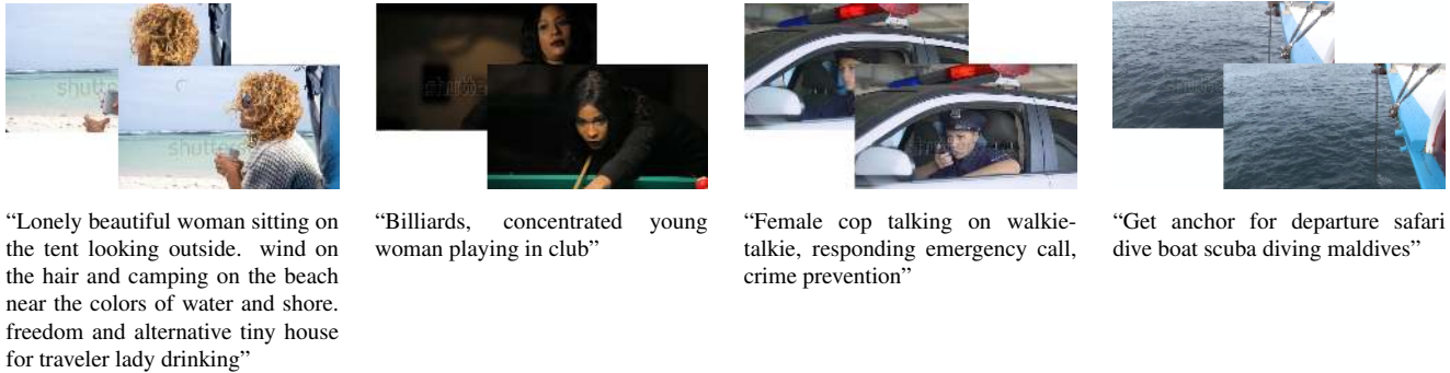
Figure 2: Example video-caption pairs from the WebVid2M dataset: Note the different captioning styles: from left to right, captions can be (i) long, slightly poetic, with disjoint sentences and phrases, (ii) succinct and to the point, (iii) have a less defined sentence structure with keywords appended to the end, (iv) mention specific places (‘maldives’). We show two randomly sampled frames for each video.

walkie-talkie” or “playing billiards” would be missed when looking at certain frames independently.