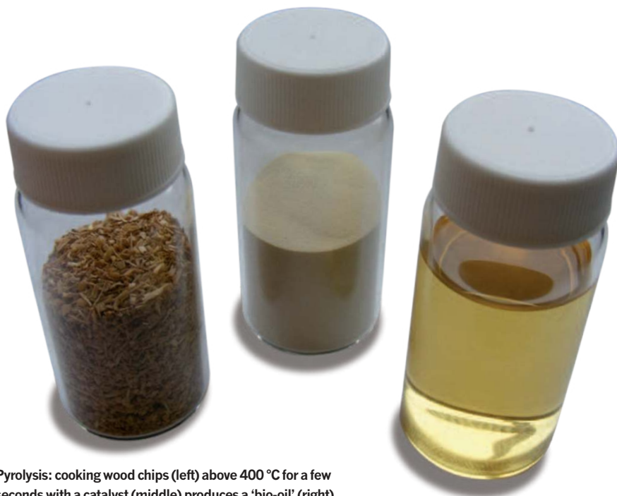
Pyrolysis: cooking wood chips (left) above 400 °C for a few seconds with a catalyst (middle) produces a 'bio-oil' (right).