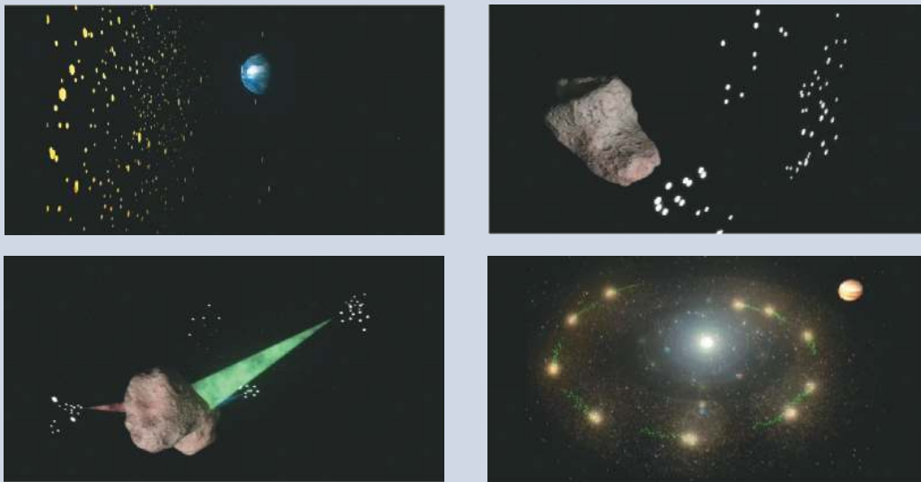
Figure A. Autonomous Nanotechnology Swarm visualization. ANTS is a concept NASA mission that, among other things, will launch highly autonomous swarms of pico-class spacecraft to explore asteroids.