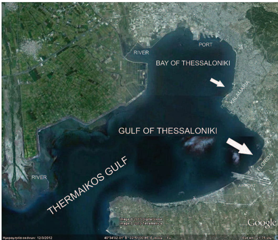
FIG. 1. Thessaloniki gulf (Google Earth). Arrows indicate the sampling localities. The city port and river estuaries in the vicinity are also indicated.

Gulf of Thessaloniki is a large semi-closed gulf that constitutes the north end of Thermaikos Gulf situated in the North Aegean Sea. The sea front of the Thessaloniki urban area and the city harbor border the greater part of the eastern and southern coastline of