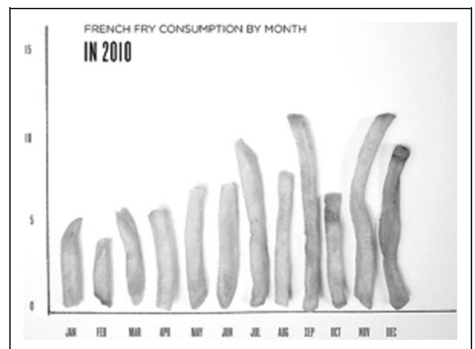
FIG. 1. One year of food consumption visualization by Lauren Manning.

A fourth project nicely incorporating various elements of quantified self-tracking, hardware hacking, quality-of-life improvements, and serendipity is Nancy Dougherty’s smile-triggered electromyogram (EMG) muscle sensor with an light emitting diode (LED) headband display. The project is