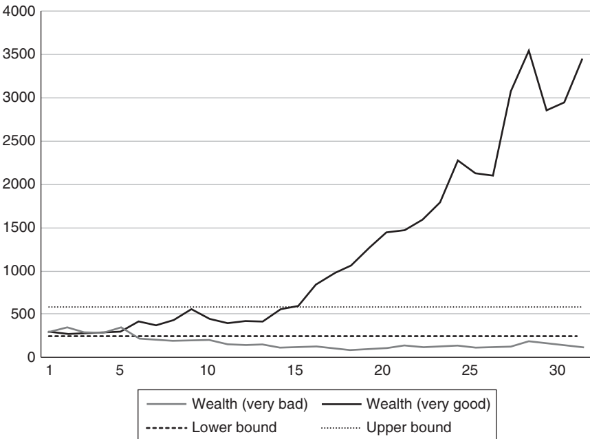
Figure 9.1 Sample paths of accumulated wealth for a one-off contribution during the 30 years for which it is invested

Figures 9.1 and 9.2 compare those two scenarios. Figure 9.1 presents the unrestricted case, showing two pension savers over 30 years with no restrictions on their retirement wealth. One saver is very unlucky to have much less than the initial investment, as shown by the grey line, and another is fortunate and ends up with a very successful investment, as shown by the