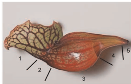
Figure 1. Sagittal section of Sarracenia purpurea illustrating the 5 Hooker zones. Zone 1, attraction; zone 2, conduction; zone 3, glandular; zone 4, digestion/absorption; zone 5, no known function although it has some similarity to zone 3. (Photograph © Barry Rice, Sarracenia.com ).

Little attention has been paid to nutrient capture by roots of carnivores. Most species are restricted to extremely nitrogen-limited habitats and subsequently, in the case of Sarracenia , acquire