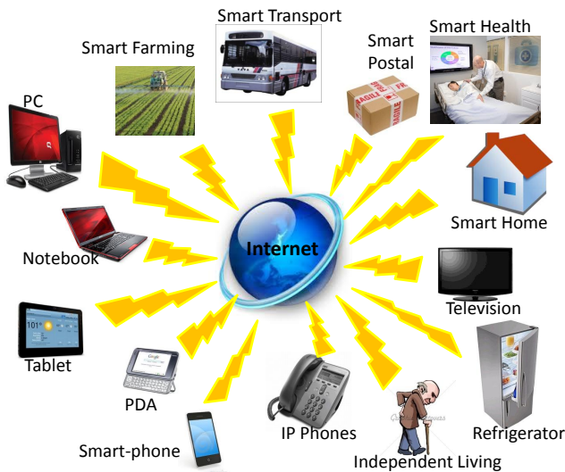
Figure 1: The IoT generic scenario.

are able to connect and communicate over the Internet that can enable a new range of opportunities [3]. Moreover, the physical objects are increasingly equipped with RFID tags or other electronic bar codes that can be scanned by the smart devices, e.g., smart phones or small embedded RFID scanner. The objects have unique identity and their specific information are embedded in the RFID tags. In 2005, the International Telecommunications Union (ITU) proposed that "Internet of Things" will connect the real world objects in both a sensory and intelligent manner [8]. Fig. 2 shows basic IoT system implementing different type of applications or services. The things connect and communicate with other things that implement the same service type. The basic simplified workflow of IoT can be described as follows: