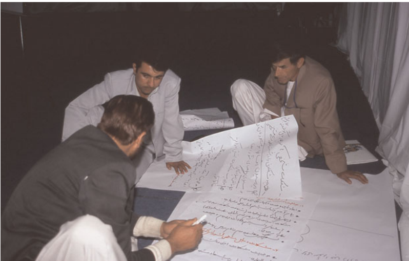
IMAGE 3 The organizers of the workshop having their debriefing, November 2007.

thus sealing the link with the government. The discussion then turned to actions for improvement in the future, particularly the articulation of CDCs and provincial authorities. Other speakers—men and women representing CDCs, and employees of the MRRD or Facilitating Partners—all boasted of the merits