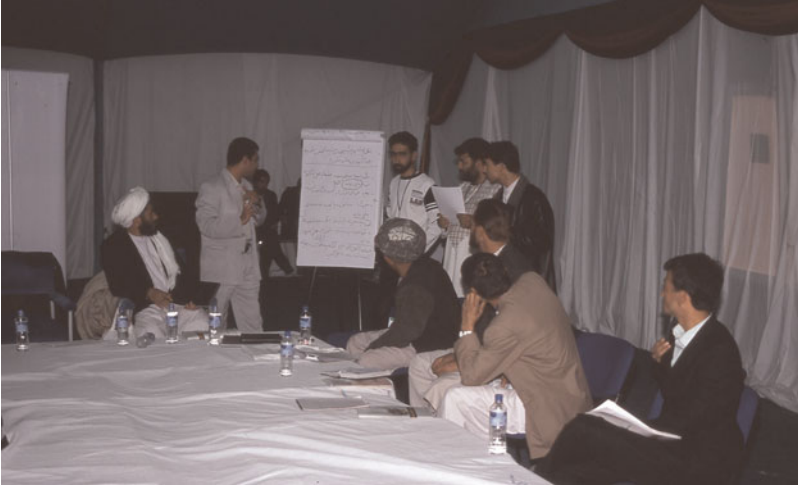
IMAGE 2 The staff of the MRRD and Facilitating Partners animate a workshop using a flip chart, November 2007.