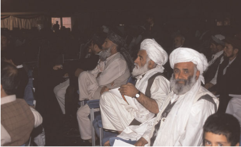
IMAGE 1 CDC representatives attending the NSP conference, November 2007.

stage, accompanied by Minister of Rural Reconstruction Ehsan Zia. Karzai addressed the assembly with intentional simplicity: “ Salâm aleikom sâheb, khosh âmadi! (Good morning gentlemen and ladies, you are welcome!)” He made a sign to the audience to take their seats before he sat down at the main desk. Two screens, on either side of the big tent, alternately showed images of the orators and the audience.