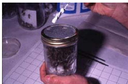
Figure 3. Approximately 7 grams of powdered sugar is added through the hardware cloth