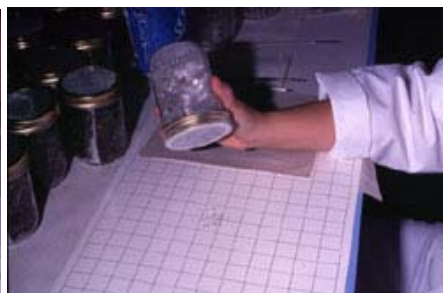
Figure 4 . The jar with bees and powdered sugar is inverted and shaken over a white surface.