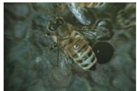
Figure 1. Varroa mite on adult honey bee. When mites can be seen on bees, colonies are usually heavily infested.

Mature female varroa mites are large, reddish brown, crab-shaped mites (length 1.1mm, width 1.6mm). Males are round, soft-bodied, whitish, and much smaller (length 0.8mm, width 0.7mm). They are seldom seen since they complete their life cycle within sealed brood cells. The life cycle of the varroa mite is divided into two phases. In the reproductive phase the mite reproduces in a sealed honey bee brood cell. In the phoretic or dispersal phase the adult female mites live on adult honey bees. They remain firmly attached to their host and are not readily observed on adult bees until colonies are heavily infested ( Figure 1 ). The number and location of the mites varies according to the time of year. Mite populations are lowest in the spring, increase during summer, and are highest in fall. During the brood rearing season, up to 90 percent of the mites in a colony will be in sealed brood cells. When brood rearing ceases, almost all live mites will be on adult bees; however, some mites can be found in hive debris throughout the year. When interpreting sampling results, the partitioning of mites among brood and adult bees must be considered.