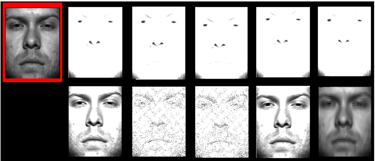
Fig. 1 – Human face and its 2D Gabor representations (feature vector components).

Therefore, for each facial image I we obtain a 3D face feature vector V(I) , having a [X \times Y \times 2n] dimension. This tridimensional feature vector constitutes a robust content descriptor of the input face. A face image (marked with a red rectangle) and its 10 Gabor representations, that constitute the components of the corresponding feature vector, are displayed in Fig. 1.