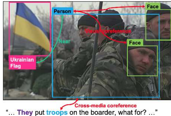
Figure 1: An example of cross-media knowledge fusion and a look inside the visual knowledge extraction.

a new comprehensive KE system, GAIA, that advances the state of the art in two aspects: (1) it extracts and integrates knowledge across multiple languages and modalities, and (2) it classifies knowledge elements into fine-grained types, as shown in Table 1. We also release the pretrained models 6 and provide a script to retrain it for any ontology.