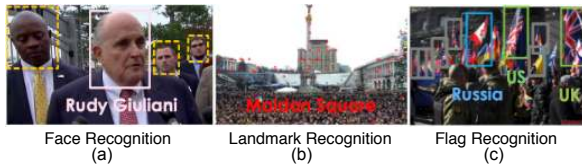
Figure 4: Examples of visual entity linking, based on face recognition, landmark recognition and flag recognition.

For the type person , we train a FaceNet model (Schroff et al., 2015) that takes each cropped human face (detected by the MTCNN model as mentioned in Section 4.1) and classifies it in one or none of the predetermined identities. We compile a list of recognizable and scenario-relevant identities by automatically searching for each person name in the background KB via Google Image Search, collecting top retrieved results that contain a face, training a binary classifier on half of the results, and evaluating on the other half. If the accuracy is higher than a threshold, we include that person name in our list of recognizable identities. For example, the visual entity in Figure 4 (a) is linked to the Wikipedia entry Rudy Giuliani 9 .