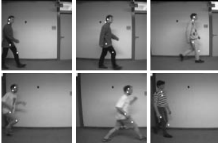
Figure 5: Some result images. The four positions are marked. The last image shows a person whose body parts could not be found successfully.