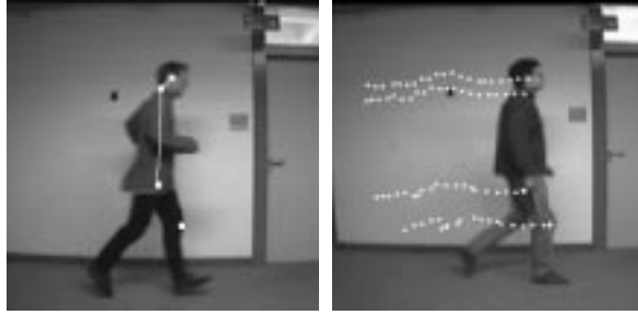
Figure 4: Left: Reference locations for the head (ear), trunk (neck) and leg (hip). The distances are marked. The fourth point is the knee, which is determined by the rotation of the leg and the length. Right: Trajectories of these four points out of 21 frames of a sequence.

where k is a norming constant. The body probability p(\hat{\zeta}_m = 1 | \mathbf{B}, \mathbf{R}, t) is derived from the relative positions of reference locations \tilde{\mathbf{x}}_i on each body part \Omega_i . The reference positions are transformed to \tilde{\mathbf{x}}_i(\mathbf{R}_i, t_i) . For two subsequent parts \Omega_i and \Omega_{i+1} we define the body probability