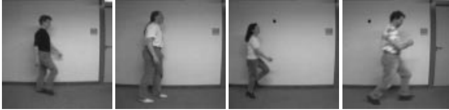
Figure 1: Sample images from sequences of people walking, limping, hopping and running

There are several approaches for motion tracking and the recognition of human body parts using a geometric model. Most of them presume contour detection which is not necessary in our system. [10] uses a model of the human body consisting of 14 cylinders with elliptic cross sections. He matches the lines of the image with the contours of the projected model. Hidden contours of the model are removed. [4] generates a 3-D model of the human body consisting of tapered super-quadrics. He uses several orthogonal views to track humans in action. [5] detects different body parts by an iterative approach using multiple views. Starting with a single deformable model, this is segmented into two parts if the model does not fit the following frame.