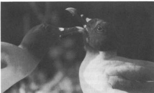
Swallow-tailed gulls show mutual preening behaviour alongside tourist trails (R.W. Tindle).

Herds of sea-lions Zalophus californicus and marine iguanas Amblyrhynchus cristatus continue their disregard for the nearest visitor, though guides wisely outlaw touching the animals. Feed-