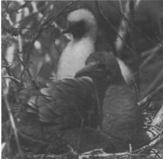
In 1981 red-footed boobies nested more densely on Genovesa Island than at any time since tourism began.

hurry so readily to the 'other-side' of the lagoon (indeed they have nested twice in the last five years at the heavily visited Punta Cormorante, a lagoon where breeding has occurred only very sporadically in the last 50 years, and was latterly recorded in 1964). The yellow warbler Dendroica petechia , previously timid, now flutters around one's shoes. For the last couple of years, a nesting pair of great blue herons Ardea herodias has overlooked launch-loads of snorkelling tourists at Devil's Crown.