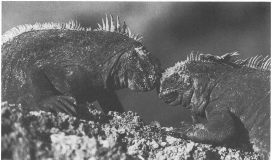
Below: Male marine iguanas exhibit ritualised combat at the visited Punta Espinosa colony (R. W. Tindle).

footed booby colony in Cryptocarpus shrub, at Darwin Bay, Genovesa Island, was redolent of nests. Indeed the number of juveniles in the bay indicated a level of breeding activity scarcely matched since the 'peak' year recorded by Nelson in 1964 (Nelson, 1969). Similarly, blue-footed booby nests at all stages of the breeding cycle were as abundant as ever on North Seymour and Punta Suarez, Española Island, as were flightless cormorants on Punta Espinosa.