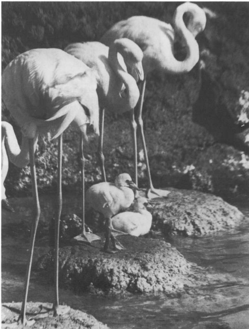
Flamingos returned to nest at Punta Cormorante in 1978, for the first time in 14 years, although tourism has increased dramatically at this site ( R. W. Tindle ).