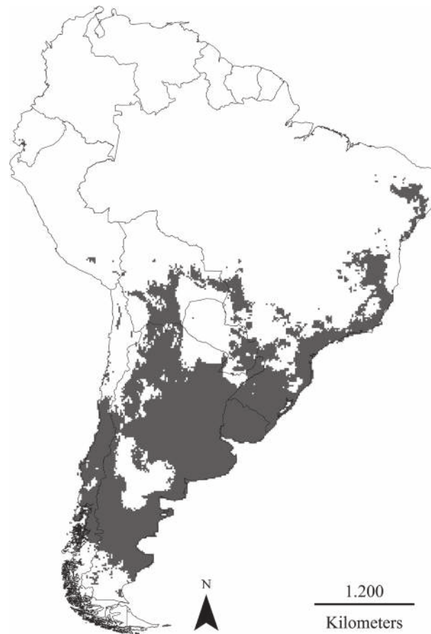
Fig. 3. Potential distribution model for Galictis cuja (Molina, 1782) visualized across South America (in gray).