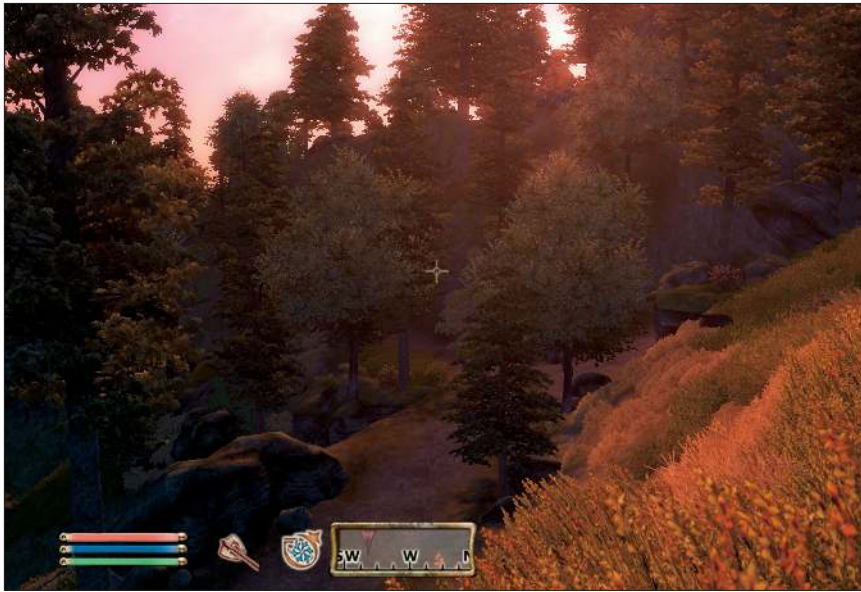
Figure 1. A screenshot of the game The Elder Scrolls IV: Oblivion , which applies procedural technology for forest areas.