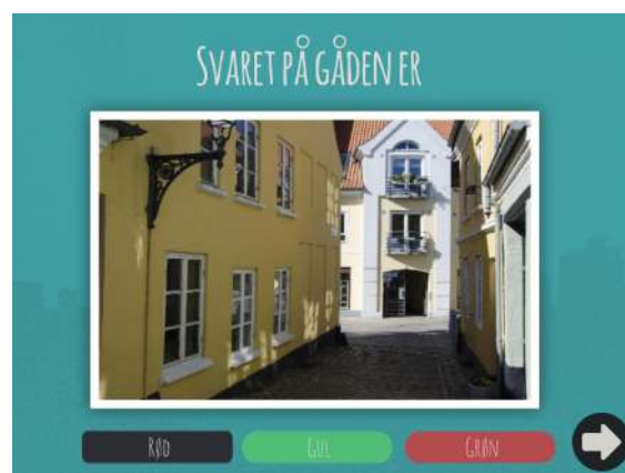
Figure 2. Control question after having found the landmark.

The last game activity is based on riddles and is similar to the game I Spy [32]. Players must spot a specific object in the vicinity based on a clue that is given to them. This approach is inspired by the LBG CityTreasure , where riddles are used at POIs. In the context of landmark navigation, the riddles describe saliency based on the visual, cognitive or structural attributes of the landmark, either in isolation or in combination (E.g. "I am tall and you can see through me"). In order for players to confirm that they have found