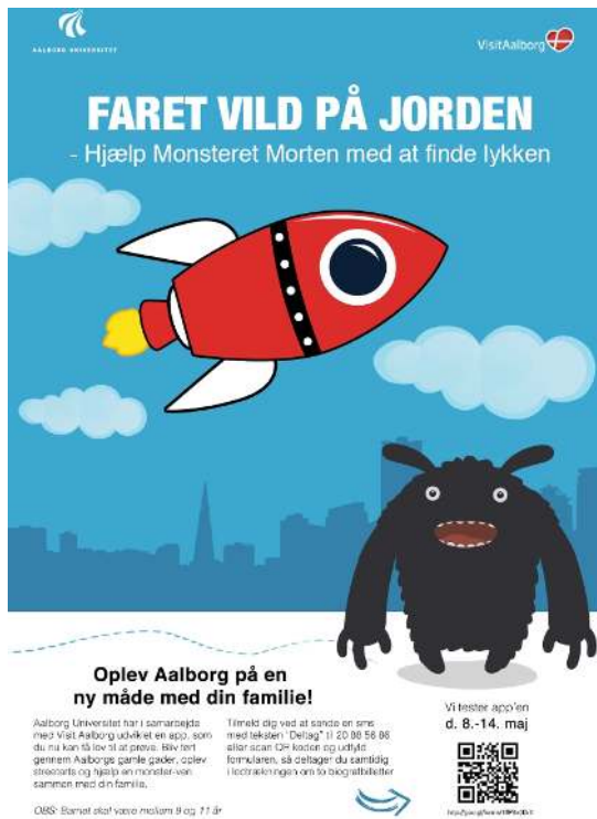
Figure 5. Poster for recruiting participants from local schools.

counterbalanced with the purpose of reducing the environmental effects met on the route on the results. Participants would either begin with map or riddles, and would end with the navigational method different from the one met in the beginning.