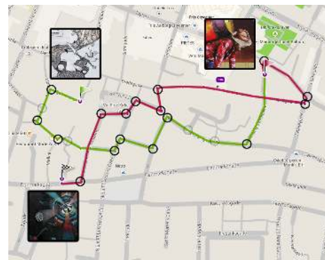
Figure 1. The route between the three street art paintings.

As wayfinding using landmarks is a navigational method that uses objects in the environment, we see potential in using it in combination with game activities between POIs for LBGs. This could result in