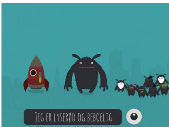
Figure 3. Riddle-based navigation showing the monster character with points in the form of fuels and friends.

the monster has eaten. The monster gives the player feedback and integrates the narrative throughout the game.