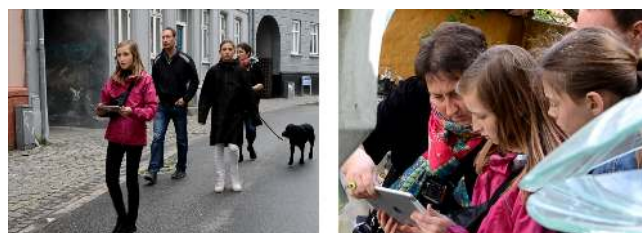
Figure 7. Child in charge of the iPad (left) and parent assisting the child (right)

Figure 7). If there were multiple children, the children not holding the iPad would often have a hard time participating in the navigation and would just follow the group. This indicates that the design does not fully encourage collaboration between multiple players, and it is possible that the collaboration between child and parent naturally arises from the fact that parents are used to assisting their children. During this collaboration however, it was clear that if the riddles were too difficult for the children, but the parents knew the answer, the parents would give their children hints in order for them to solve the riddle. From this, it could be seen that harder riddles encouraged more communication and collaboration.