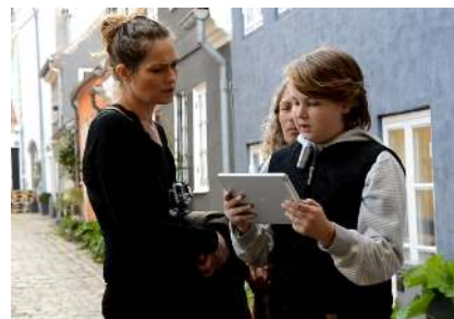
Figure 6. All participants attending to the iPad, trying to solve the riddle

For both conditions, collaboration was mostly seen between the child using the iPad and a parent. Here, the parent would act as an assistant to the child and take over the iPad if the child gave up (see