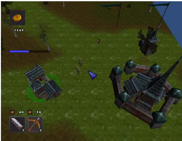
Fig. 2. Screenshot from the RTS implementation

gratitude from Alice, without having to script all these possibilities explicitly.