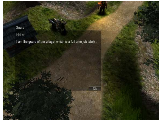
Fig. 1. Screenshot from the RPG implementation

Classical RPGs involve a storyline with quests in which the player character can interact with various friendly characters but also fight or compete against enemies. RPGs have the potential for an infinite variety of stories and situations, including NPC character